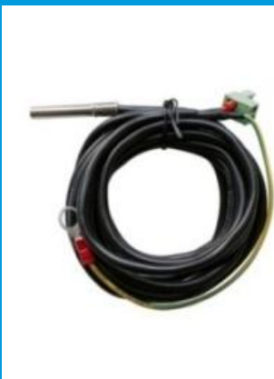
Remote temp. sensor RTS300R10K5.08A (3m)