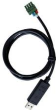
PC communication cable CC-USB-RS485-150U-3.81 (1.5m)